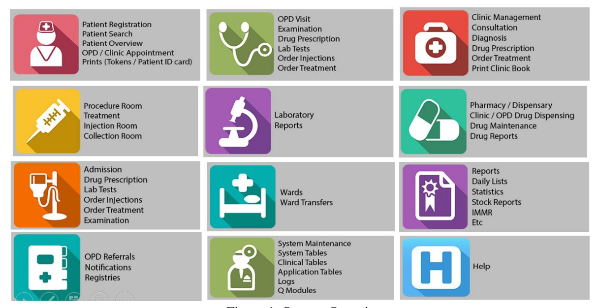
Figure 1: System Overview

HHIMS is currently hosted on local servers located at each hospital and running as a standalone system and data sharing amongst the hospitals is difficult which a mandatory requirement in the future is.